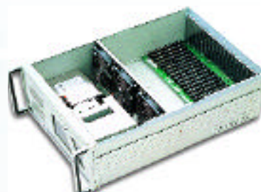
▲ Top view of RPC-520